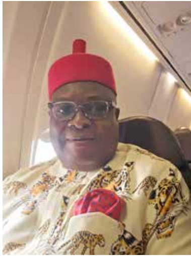
BA (Hons), LL.B (Hons), BL, PGD, MBA, D.Lit/Juris., mnim, KSC, AmbP-UN. President-General of Igbo-Ukwu Development Union, IDU.