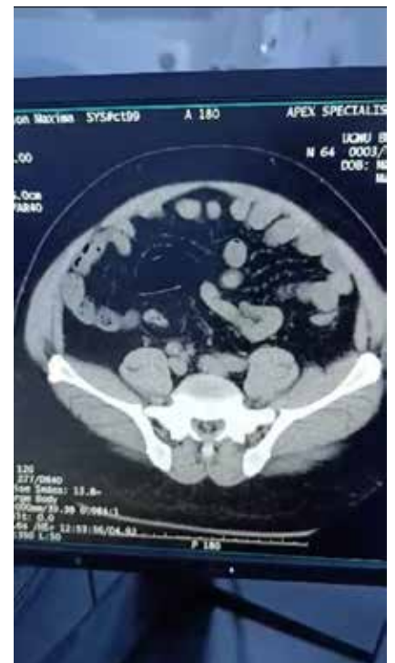
Free Scan took place at Apex Multispecialty Hospital Awka, Anambra State in midweek of March, 2026.